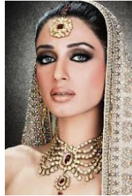
Queen Vashti e.g. The Adulterous House of Israel

When we receive the 'TREE OF LIFE' and care for it, we eat its fruit (seed) and it grows within us, as a baby grows inside its mother. If the mother will not receive the seed of her husband, she cannot reproduce. If she receives seed from someone other than her husband, she produces a bastard child who is cursed by his father. It is called adultery!