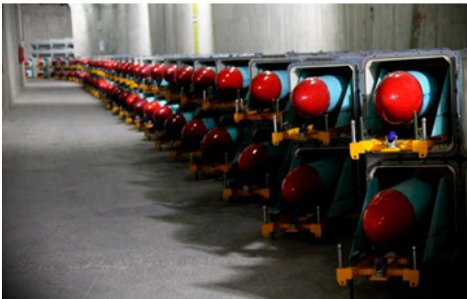
Pictured above: Iranian missiles stored in an undisclosed location

Of course, we know that Haman's diabolical plans were thwarted. By God's grace, the terrible edict was rescinded. The Jews then turned the tables on their enemies. This culminated in the hanging of Haman on his own gallows, and also included the hanging of his ten sons.