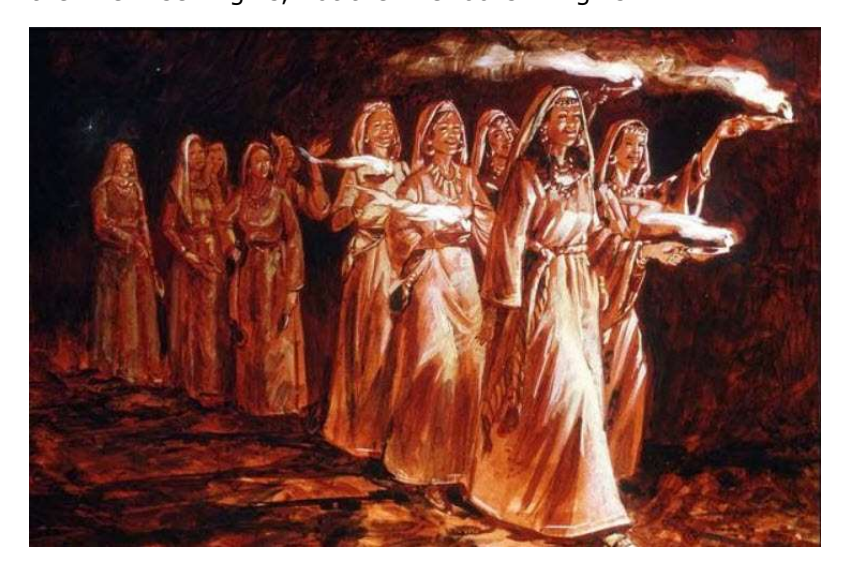
In this spirit, I wish you all a CHAG SAMEACH for Yom Teruah!

Let us watch and pray and blow a loud shofar blast, a Teruah, so those still asleep and not on YHWH's calendar will wake up, repent, return to the Torah, and be counted among the five wise virgins, not the five foolish virgins!