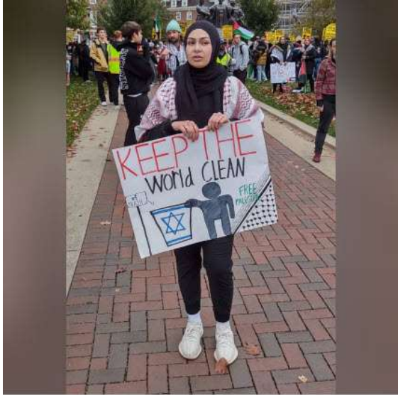
Urbana, Illinois - a woman in a hijab is seen holding up a Nazi like sign wanting to rid the world of Jews. 6 12:04 PM

In previous terrorist attacks in Israel, Israel was always blamed unilaterally.